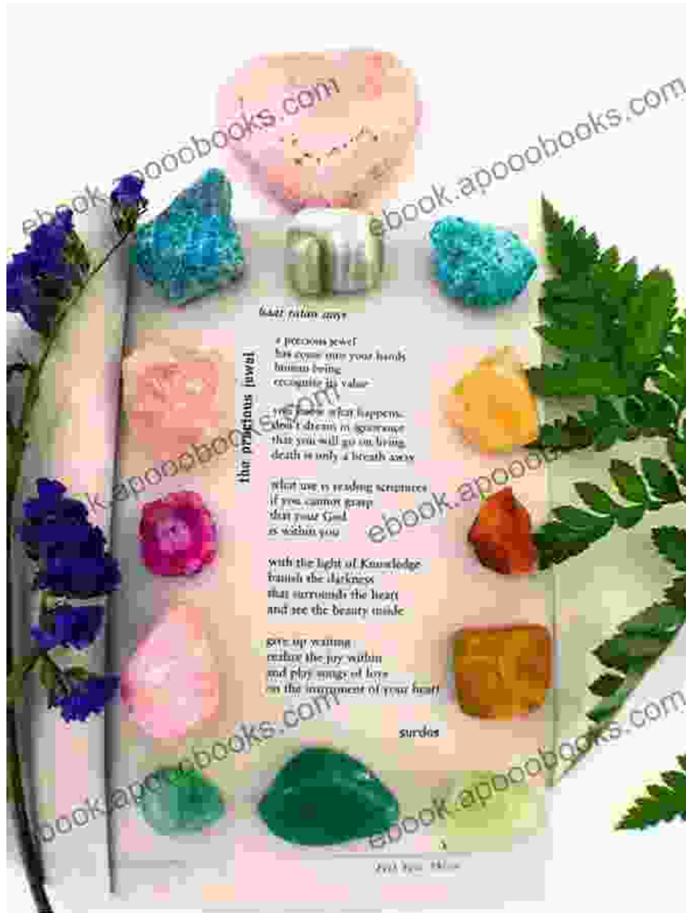
Family Portrait With Scythe: Poems