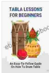
Tabla Lessons For Beginners: An Easy-To-Follow Guide On How To Drum Tabla by Jayson Beaster-Jones