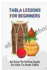
Tabla Lessons For Beginners: An Easy-To-Follow Guide On How To Drum Tabla by Jayson Beaster-Jones