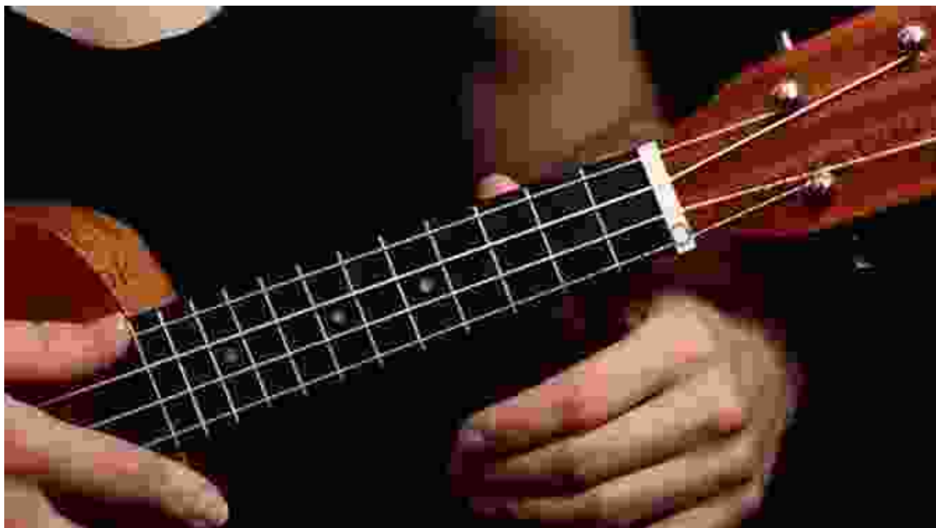
Fig. 2: Essential Ukulele Techniques for Mastering Riffs

skills that will elevate your playing and empower you to create your own captivating riffs. Step-by-step instructions and clear illustrations will guide you through each technique, ensuring that you gain a deep understanding of the mechanics involved.