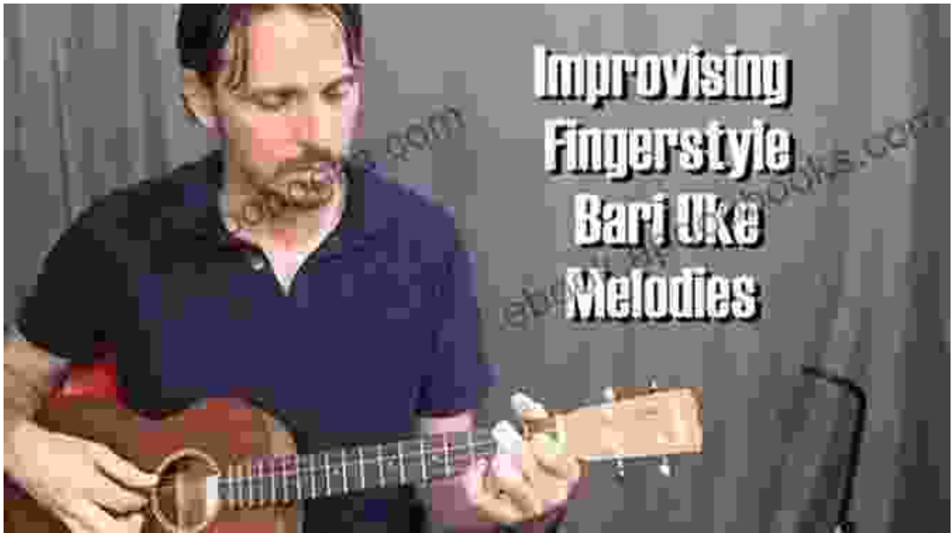
Fig. 4: Unleashing Your Musicality through Improvisation and Composition