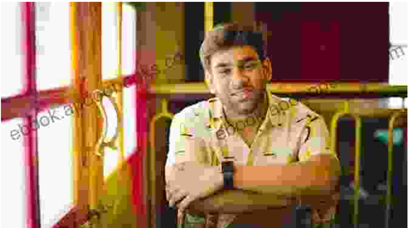
Suite Sur: 90 by Mayank Mishra

Free Download your copy of "Suite Sur 90" today and embark on a literary adventure that will leave an indelible mark on your imagination.